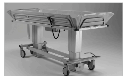
Tilting for "Trendelenburg" position and easy drainage.