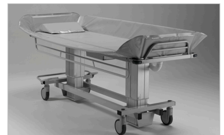
Side rails swing down or lock in horizontal position for transfer and up position for safe transport.

The side rails keep the person safely in place. Side rails swing down for transfer and lock into up position for person security and a secure transport. The trolley has central foot operated castor brakes and straight steering. The stretcher has two positions, flat for transfer and tilt for transport, shower and improved drainage. TR 4200 is delivered with mattress, high capacity rechargeable batteries, hand control, drain plug and hose.